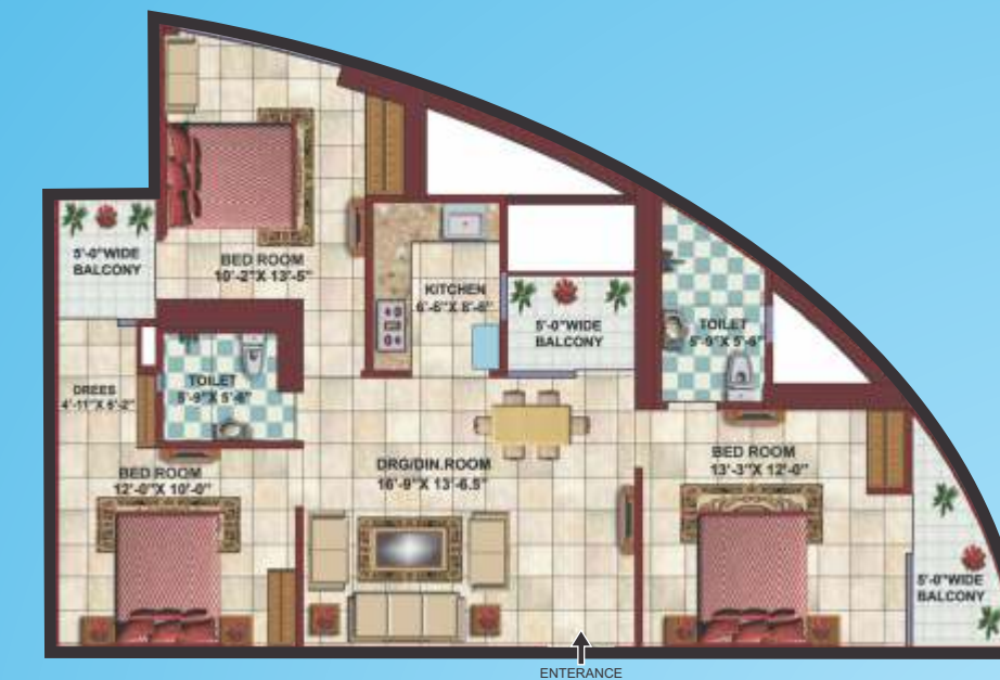
3BHK - Area: 1475 Sq. Ft.