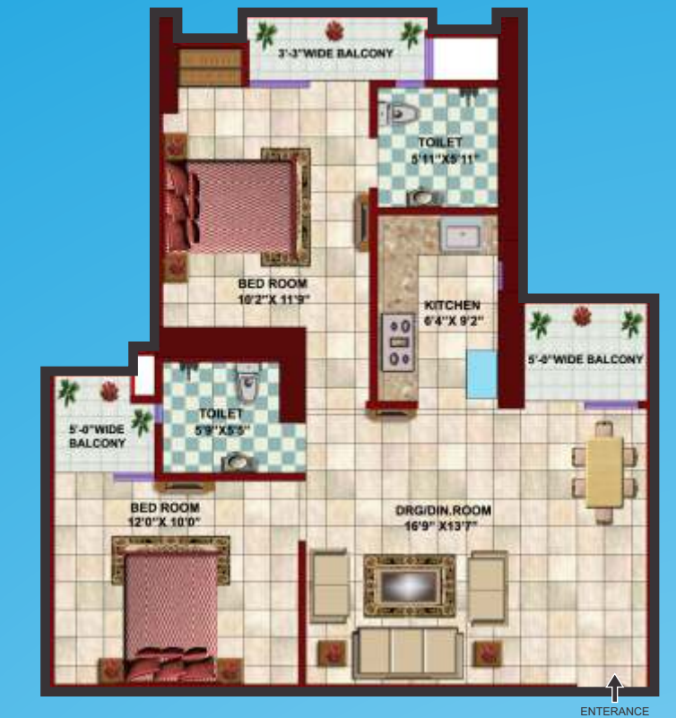
2BHK - Area: 1050 Sq. Ft.